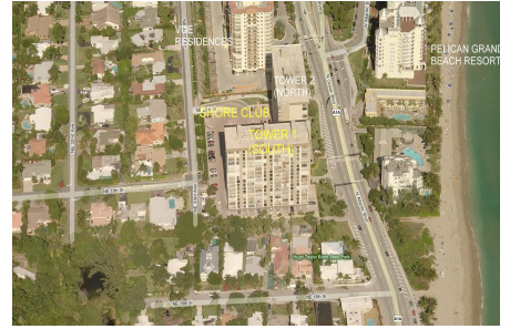
Built in 1977 - 95 units - 17 floors

Shore Club Condominium Association 954-561-2623