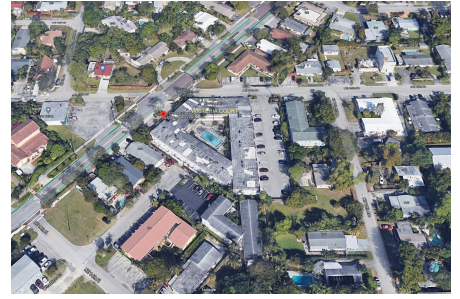
Built in 2006 - 46 units - 2 floors