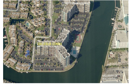
Built in 1974 - 296 units - 11 floors

200 Leslie Condominium Association, Inc 200 Leslie Drive Hallandale Beach, FL33009-7311 (954) 458-2225