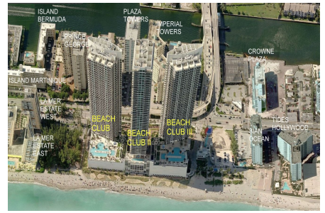
Built in 2005 - 385 units - 44 floors

http://www.atlanticandpacific.net/beachclub/sub_category_list.asp?category=5&title=Cont