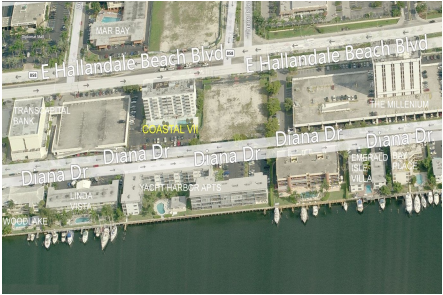
Built in 1970 - 80 units - 7 floors

Coastal VII Apts Inc 2200 E Hallandale Beach B Hallandale, FL 33009 954-454-0363