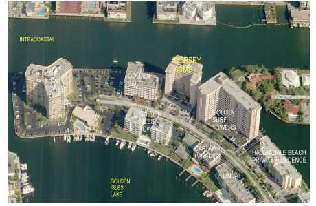
Built in 1971 - 94 units - 14 floors