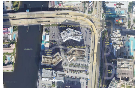
Built in 1970 - 140 units - 11 floors

Imperial Towers Condominium Address: 1825 S Ocean Dr, Hallandale Beach, FL 33009 Phone: +1 954-454-8822 https://imperialtowers.org/