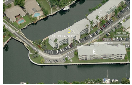
Built in 1964 - 30 units - 3 floors

Isle of Paradise C Inc 460 Paradise Isle Blvd Hallandale Beach, FL 33009 (954) 456-6084