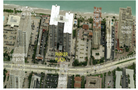
Built in 1971 - 518 units - 21 floors

Condominium Association of Parker Plaza Estates, Inc. 954-458-5111 & (954) 457-9609