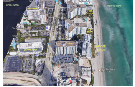
Built in 2015 - 49 units - 24 floors