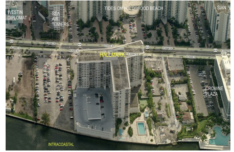
Built in 1981 - 374 units - 17 floors

The Hallmark Of Hollywood Condominium Association Inc 3800 S Ocean Drive # 1 Hollywood (954) 457-8311