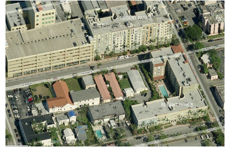
Built in 2006 - 166 units - 8 floors