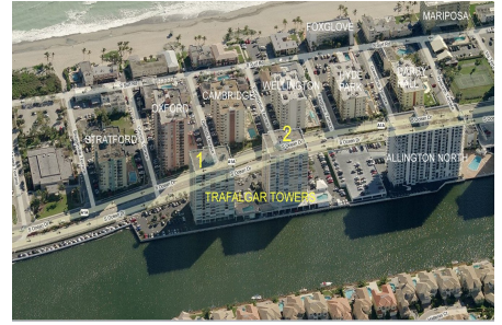
Built in 1971 - 120 units - 16 floors

Trafalgar Towers Association 1400 S Ocean Dr Apt 806, 33019-2307 Hollywood, FL (954) 927-2400 http://www.facebook.com/pages/Trafalgar-Towers-Association/103356836398706