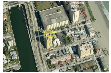
Built in 1973 - 45 units - 5 floors

Victoria Towers Condominium Association, Inc. 211 South Ocean Drive Hollywood 33019 (954) 920-3630