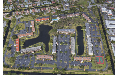
Built in 1982/1986 - 492 units in total - 5 floors

Campbell Property Management - Emergencies (954) 739-1600 Property Manager (954) 739-1600 thenry@campbellproperty.com On-Site Office (954) 741-5316 cascadesoflauderdale@gmail.com https://www.cascadesoflauderdale.com/