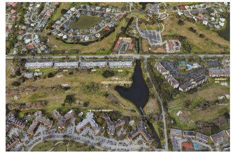
Built in 1974 - 432 units in total - 6 floors

The Greens of Inverrary Management Company: Fyve Property Management, Inc. 5100 W. Copans Road, Suite 100 Margate, Florida 33063 954-741-8811 Property Manager: ext. 1208 Sales & Lease Applications: ext. 1204 Maintenance Payments: ext. 1078 https://www.thegreensofinverrary.com/