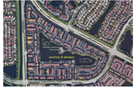
Built in 2003 - 848 units - 2 floors

Aventine at Miramar HOMEOWNERS/CONDO ASSOCIATION 2436 Centergate Drive Miramar, FL 33025 (954) 435-464