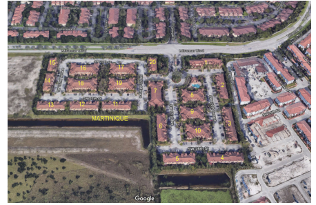
Built in 2007 - 190 units - 2 floors

Martinique At Miramar Community Association, Inc 1145 Sawgrs Corp Parkway Sunrise, FL 33323 Phone: (954) 846-1225