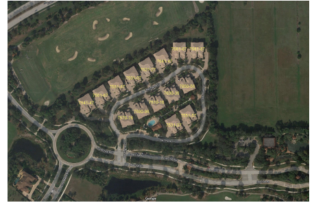
Built in 2003 - 60 units - 2 floors

Caseras at Parkland Address: 10001 Old Club Rd, Parkland, FL 33076 Phone: +1 954-905-2120 https://ourpgcc.com/