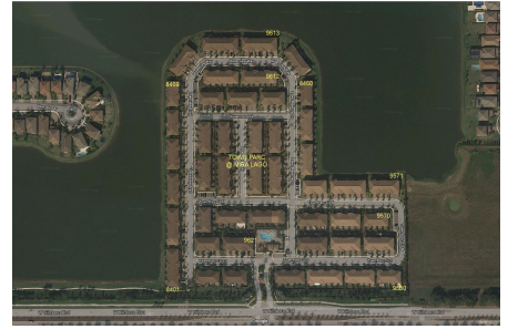
Built in 2014/2017 - 229 units - 2 floors

Lennar at MiraLago at Parkland Address: 10320 Peninsula Place, Parkland, FL 33076 Phone: +1 954-369-0078 https://web.mmilive.net/miralago/Home.aspx