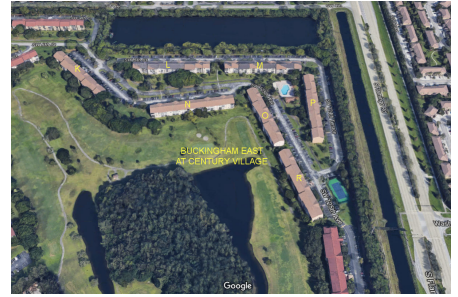
Built in 1987 - 392 units - 4 floors

Century Village Pembroke Pines 13800 SW 5th Ct, Pembroke Pines, FL 33027 (954) 431-2137