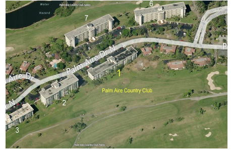
Built in 1968 - 40 units 4 floors

Palm-Aire Village Condominium Association No. 1, Inc 2945 W Cypress Creek Rd Fort Lauderdale, FL 33309 http://palmaire1.net/palmaire1/outside_home.asp