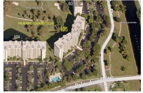
Built in 1981 - 80 units - 10 floors

Palm Aire 105 Association 625 Oaks Dr, Pompano Beach, FL 33069 (954) 969-0722