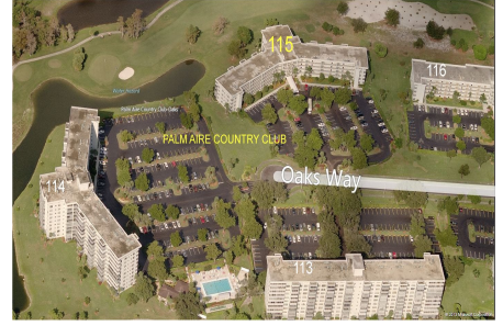
Built in 1982 - 59 units - 5 floors

Mwi/Campbell Management Co, Palm Aire Country Club Condominium Association 3500 Gateway Drive # 202 Pompano Beach, FL 33069-4870 (954) 968-4481