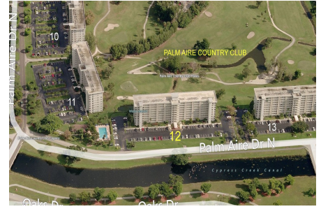
Built in 1970 - 90 units - 9 floors

Number of units: 90 Number of active listings for rent: 0 Number of active listings for sale: 2 Building inventory for sale: 2% Number of sales over the last 12 months: 2 Number of sales over the last 6 months: 2 Number of sales over the last 3 months: 1