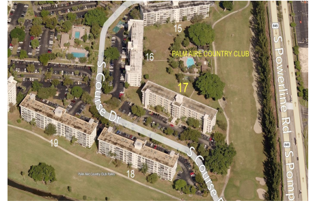
Built in 1971 - 60 units - 6 floors

Palm Aire Condo Assoc-Bldg 17 3000 S Course Dr Pompano Beach FL 33069 954-974-3093