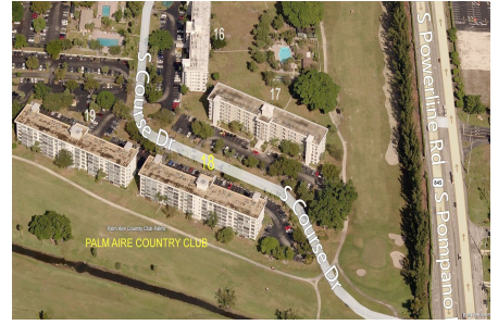
Built in 1971 - 60 units - 6 floors

Palm Aire Condo Assoc-Bldg 18 3001 S Course Dr Pompano Beach FL 33069 954-970-0896