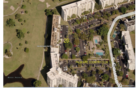
Built in 1971 - 90 units - 9 floors

Palm Aire Condo Assoc-Bldg 20 2671 S Course Dr Pompano Beach FL 33069 954-970-0974