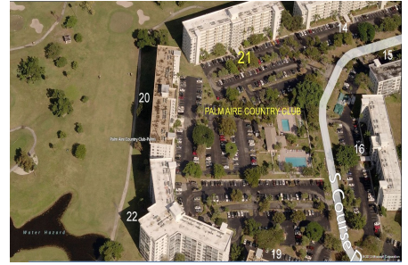
Built in 1972 - 90 units - 9 floors

Palm Aire Condo Assoc-Bldg 21 2661 S Course Dr Pompano Beach FL 33069 954-970-0975