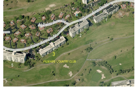
Built in 1973 - 40 units - 4 floors

Palm Aire Association Bldg 3 2851 S Palm Aire Dr, Pompano Beach, FL 33069 (954) 642-7363