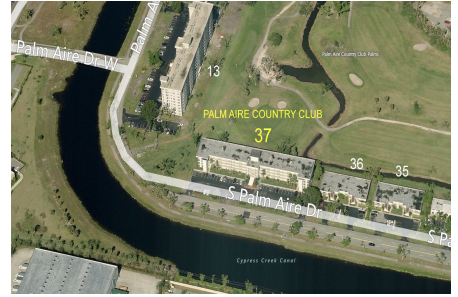
Built in 1973 - 40 units - 4 floors

Number of units: 40 Number of active listings for rent: 0 Number of active listings for sale: 1 Building inventory for sale: 2% Number of sales over the last 12 months: 2 Number of sales over the last 6 months: 0 Number of sales over the last 3 months: 0