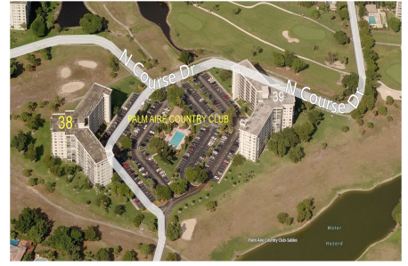
Built in 1973 - 107 units - 9 floors

Number of units: 107 Number of active listings for rent: 0 Number of active listings for sale: 2 Building inventory for sale: 1% Number of sales over the last 12 months: 5 Number of sales over the last 6 months: 4 Number of sales over the last 3 months: 1