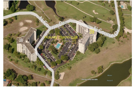
Built in 1973 - 107 units - 9 floors

Number of units: 107 Number of active listings for rent: 2 Number of active listings for sale: 5 Building inventory for sale: 4% Number of sales over the last 12 months: 4 Number of sales over the last 6 months: 1 Number of sales over the last 3 months: 1