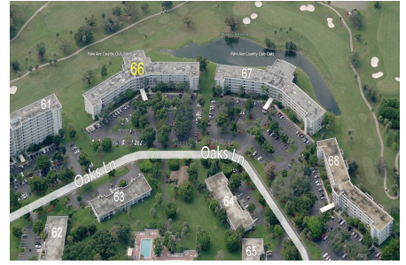
Built in 1979 - 59 units - 5 floors

Mwi/Campbell Management Co, Palm Aire Country Club Condominium Association 3500 Gateway Drive # 202 Pompano Beach, FL33069-4870 (954) 968-4481