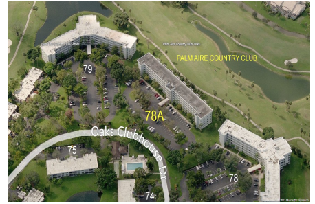
Built in 1979 - 50 units - 5 floors

Number of units: 50 Number of active listings for rent: 0 Number of active listings for sale: 1 Building inventory for sale: 2% Number of sales over the last 12 months: 5 Number of sales over the last 6 months: 2 Number of sales over the last 3 months: 0