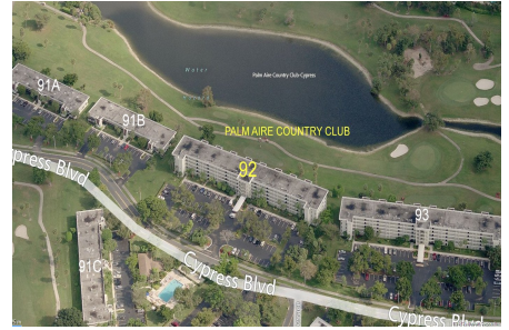
Built in 1979 - 50 units - 5 floors

Number of units: 50 Number of active listings for rent: 0 Number of active listings for sale: 3 Building inventory for sale: 6% Number of sales over the last 12 months: 4 Number of sales over the last 6 months: 1 Number of sales over the last 3 months: 1