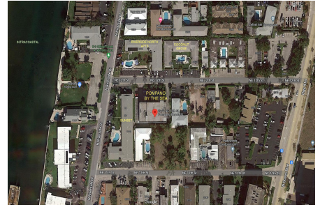
Built in 2006 - 25 units - 6 floors

Pompano By the Sea Condominium Address: 3212 NE 12th St apt #304, Pompano Beach, FL 33062 Phone: +1 954-783-3474