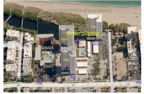
Built in 1969 - 65 units - 13 floors

Tiffany Gardens East 1600 N Ocean Blvd Pompano Beach, FL - Broward County (954) 781-0430