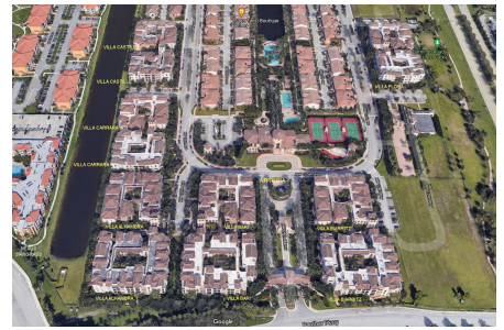
Built in 2007 - 66 units - 4 floors

Artesia Master Association Inc 12550 NW 29th Mnr Sunrise, FL 33323 (954) 514-1045