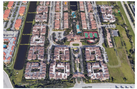
Built in 2007 - 51 units - 4 floors

Artesia Master Association Inc 12550 NW 29th Mnr Sunrise, FL 33323 (954) 514-1045