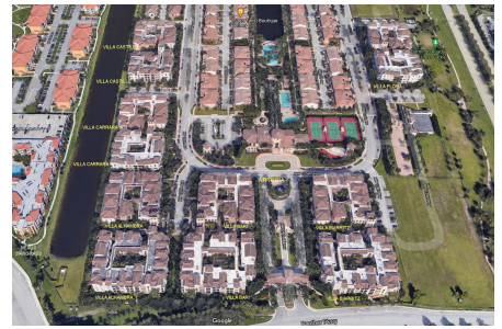
Built in 2007 - 52 units - 4 floors

Artesia Master Association Inc 12550 NW 29th Mnr Sunrise, FL 33323 (954) 514-1045