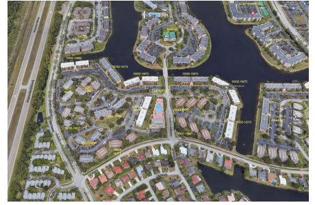
Built in 1989 - 444 units - 3 floors

Kings Point 7620 Nob Hill Road, Tamarac, FL 33321 Tel. (954)726-4120