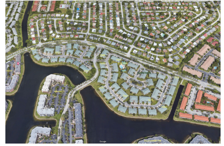
Built in 2000 - 232 units - 2 floors

Kings Point 7620 Nob Hill Road, Tamarac, FL 33321 Tel. (954)726-4120