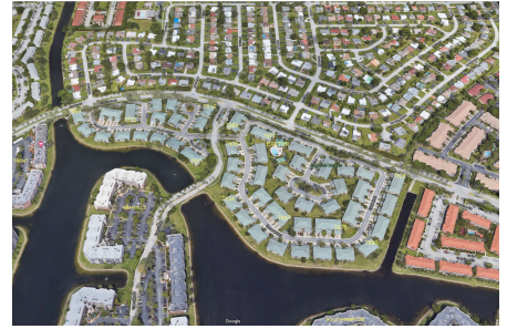
Built in 2000 - 232 units - 2 floors

Kings Point 7620 Nob Hill Road, Tamarac, FL 33321 Tel. (954)726-4120