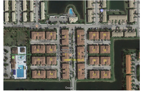
Built in 2006 - 196 units - 2 floors

Hampton Hills Community Association 5753 Hampton Hills Blvd Tamarac, FL 33321 (954) 720-1109 http://www.myhamptonhills.com/