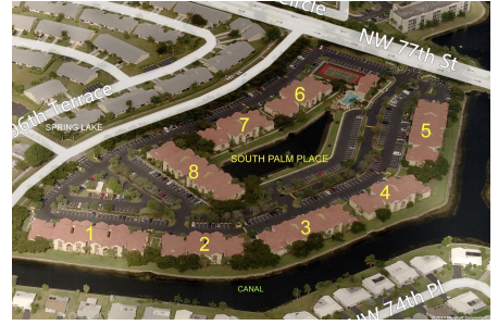
Built in 2006 - 208 units - 3 floors