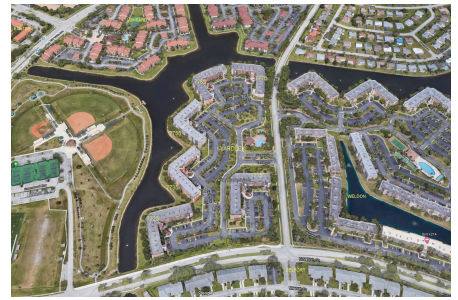
Built in 2004 - 360 units - 4 floors

Kings Point 7620 Nob Hill Road, Tamarac, FL 33321 Tel. (954)726-4120 http://kingspoint.com/