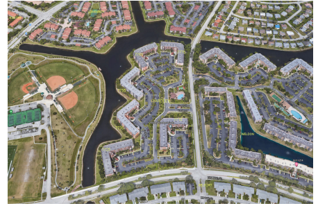
Built in 2004 - 360 units - 4 floors

Kings Point 7620 Nob Hill Road, Tamarac, FL 33321 Tel. (954)726-4120 http://kingspoint.com/