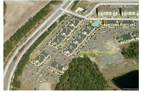
Built in 2007 - 192 units - 2 floors

Signature Realty & Management 4003 Hartley Rd Jacksonville, FL 32257 (904) 268-0035 https://www.srmiproperties.com/