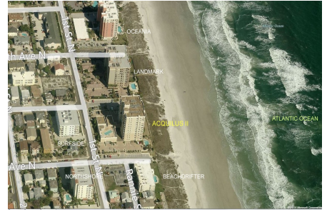
Built in 2006 - 45 units - 12 floors

ACQUILUS II CONDOMINIUM ASSOCIATION, INC. http://acquilusii.com/