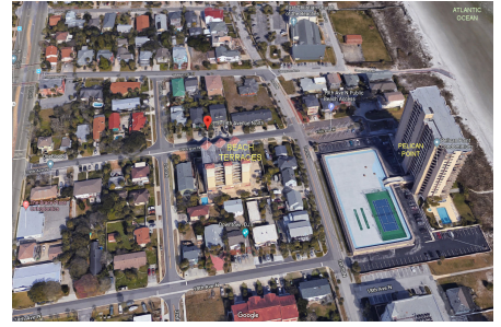
Built in 2005 - 18 units - 7 floors

Number of units: 18 Number of active listings for rent: 0 Number of active listings for sale: 0 Building inventory for sale: Number of sales over the last 12 months: 0% Number of sales over the last 6 months: 0 Number of sales over the last 3 months: 0