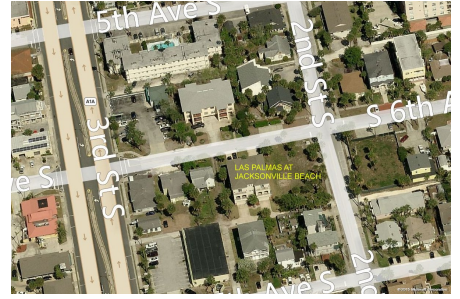
Built in 2004 - 4 units - 3 floors

Number of units: 4 Number of active listings for rent: 0 Number of active listings for sale: 0 Building inventory for sale: Number of sales over the last 12 months: 0% Number of sales over the last 6 months: 0 Number of sales over the last 3 months: 0